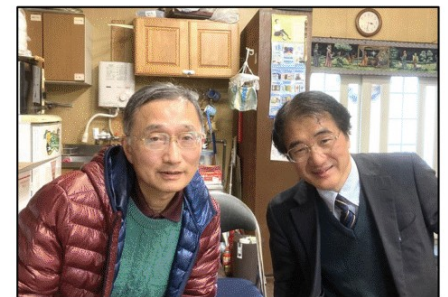
Mito church elders

All these interactions have gone extremely well. We have acquired greater understanding of common resource needs, greater motivation to maintain communication, and greater eagerness to coordinate future planning.